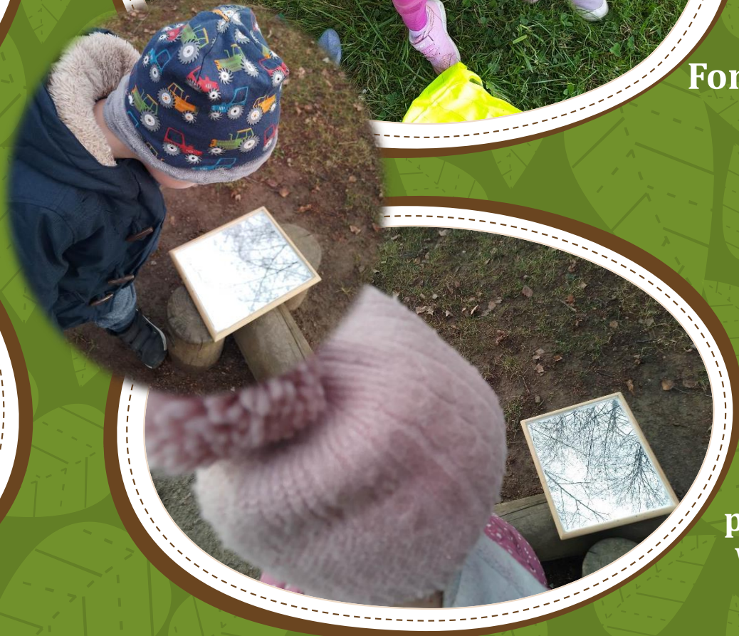
Different views, perspectives. Viewing the treetops in winter.