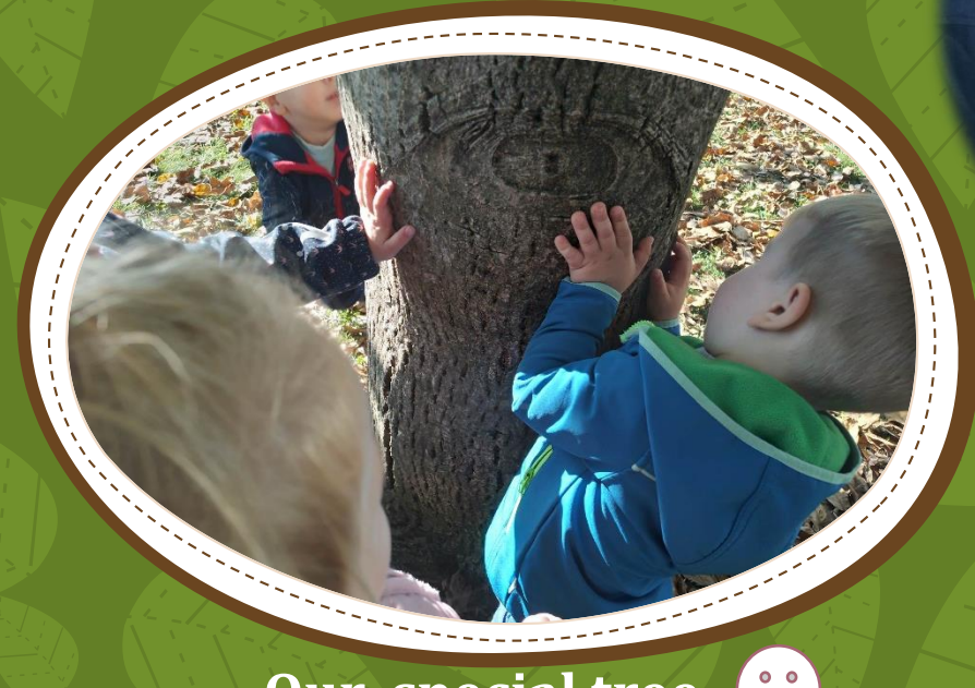
Our special tree